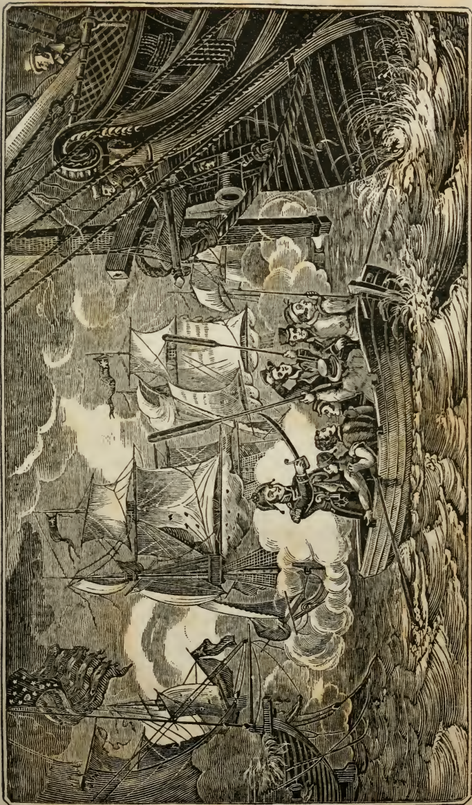
BATTLE OF LAKE ERIE ..... COMMODORE PERRY.